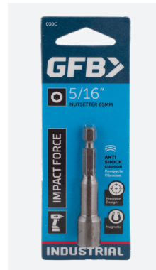
BULK BARCODED PACK