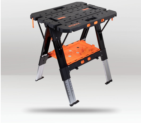
AS A WORKTABLE