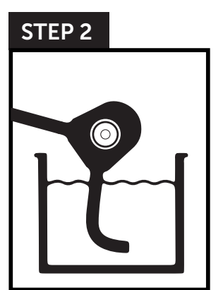
All air pockets must be expelled from the intage hose. Full length of intake hose must be fully submerged before starting pump.